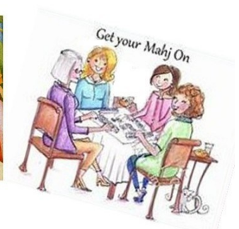
Friday, April 25th